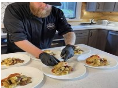
“The chef that always impresses”